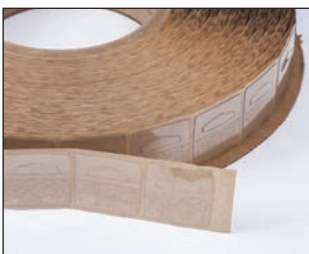
The Tab-A-Matic™ uses hang tabs on a roll to speed up hand application.

dispenser automatically peels and advances the next hang tab.