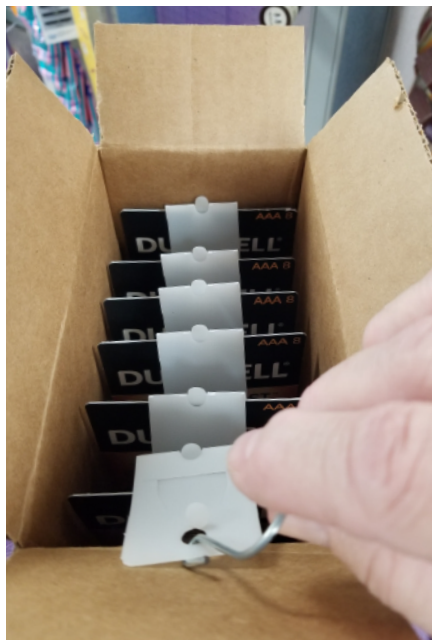
The 2-MFB is an accordion-fold display strip.