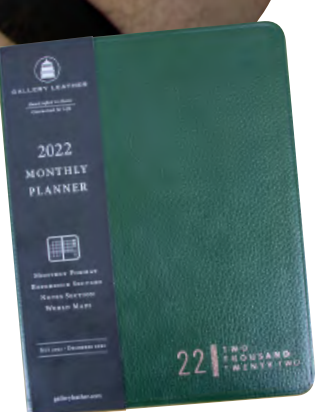
Gallery Leather uses a paper sleeve that wraps around the front cover and is secured on the inside with a Do-It Seal Tab.

Many Do-It Products are designed to be invisible. They quietly and effectively do their job while never distracting customers from the product or message on the package.