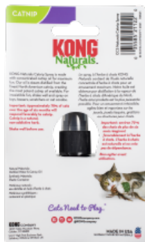
The front of the 2-DFH Hang Tab Card for Kong was printed on film laminated to the white 15 mil PET plastic. The back of the card was printed directly on the plastic material.