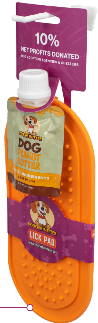
The 2-KHP Bottle Neck Hang Tab securely combines and hangs the Poochie Butter Squeeze Pack and Lick Pad anywhere in the store.

Dilly's Poochie Butter — working together with Do-It Corporation. Two unique products — two unique hanging solutions.