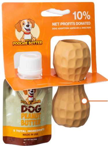
The 2-KHR Bottle Neck Hang Tab securely displays a Poochie Butter Squeeze Pack and the Peanut Toy Filler together making it easier for shoppers to select a delicious treat for their dog.