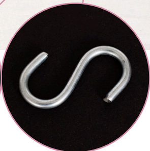
(20) Heavy Duty "S" Hooks