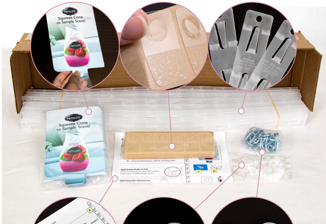
(20) 2-FLRNH Display Strips