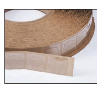
The Tab-A-Matic™ uses hang tabs on a roll to speed up hand application.

dispenser automatically peels and advances the next hang tab. With our TAB-A-MATIC™ dispenser you can apply up to twice as many hang tabs compared with traditional hand application methods. Please call today for more information