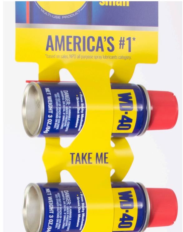
The MDH bandolier strip is easy to load.